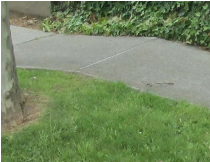
No displacement with TripStop

The TripStop “Double Hinge” joint allows concrete slabs to move with the Earth ie, tree root growth, soil movement and thermal expansion without creating a trip hazard.