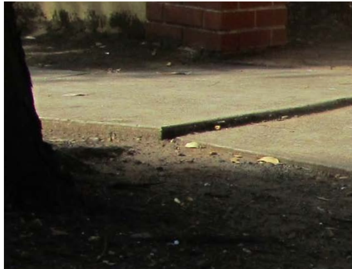
Displacement without TripStop